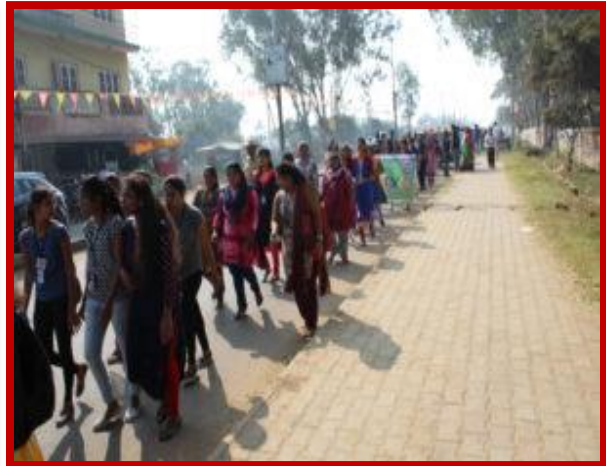
Polio Vaccination and Rally on 28 th January 2018