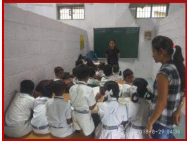
Visit to SVR Global standard school on 31 st August 2018