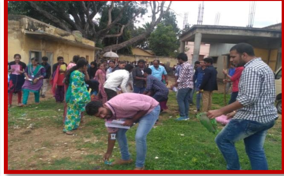
Swachh Bharath Abhiyan program on 29th August 2017