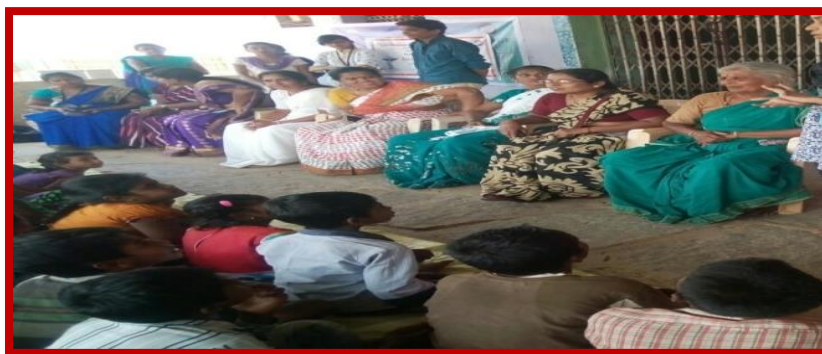
Awareness program on cleanliness, health and nutrition at Kolar on 7 th April 2016

The Department of Life Sciences organized awareness program on Cleanliness, Health and Nutrition for the Govt. School children and public at Kolar on 7 th April 2016. The aim of this program is to bring awareness on General hygiene, Diabetes Mellitus and diet requirement for good health etc. The School students and teachers are sensitized about cleanliness, Health and Nutrition. 75 students and 5 teachers actively participated to encourage the students and public to follow the healthy habits for healthy life.