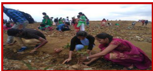
Plantation Program on 11 th August, 2017