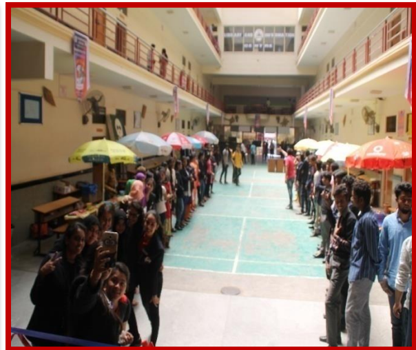
Chef Kings on 6 th Sep 2016