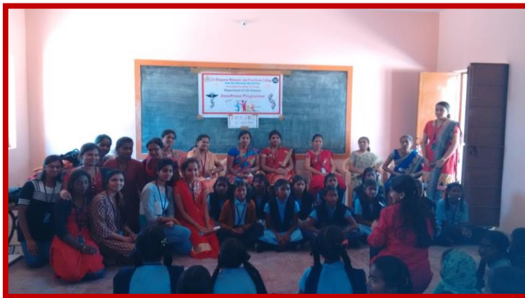
Health Awareness and clean environment program on 14 th Feb 2015

An awareness program was organized for the Government secondary school students at Hullibelli, Bangarpet on 14 th Feb 2015 about General Hygiene for girls, H1N1, Diabetes Mellitus, Nutrition and Health for all the students. Students enthusiastically involved, interacted and gained knowledge about role of Nutrition in Health. 5 faculty members and 70 students from the Life Sciences Department actively participated.