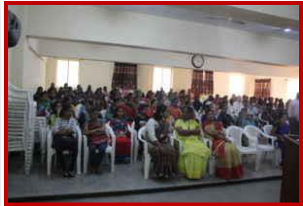
Awareness program on Voters Day on 25 th January 2019