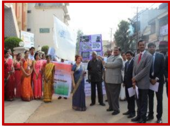
Helmet Awareness rally on 23 rd January 2018