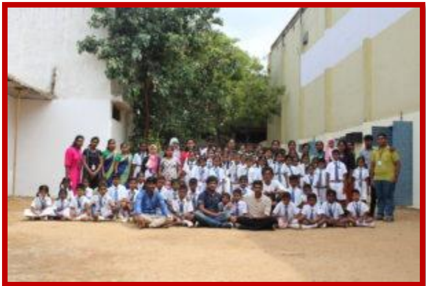
Service to Global Standard School on 1 st August 2018