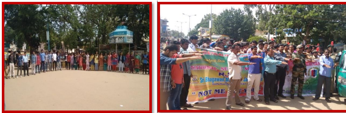
Shramadan program on 4 th Feb 2016

The NSS unit of SBMJC, K.G.F organized Shramadan program at Municipal park and Gandhi circle, K.G.F. to inculcate the culture of cleanliness to the public of K.G.F. 90 students and 4 faculty members participated.