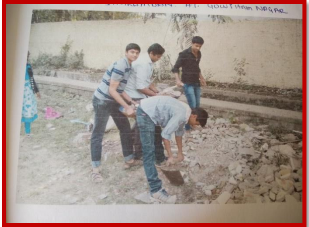
Nirmala Project on 25 th Aug 2014