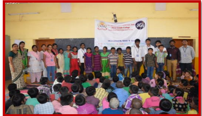
Career guidance and life skills on 25 th Sep 2016