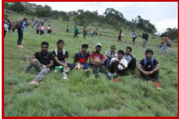
Trekking to Channagiri hills on 16 th September 2018