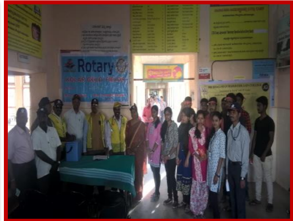
Polio immunization at Maternity Hospital, K.G.F on 24 th October 2016