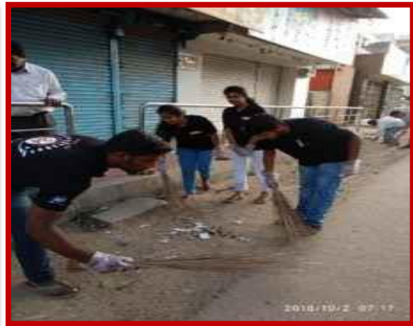
Shramadan on the occasion of Gandhi Jayanthi on 2 nd October 2018