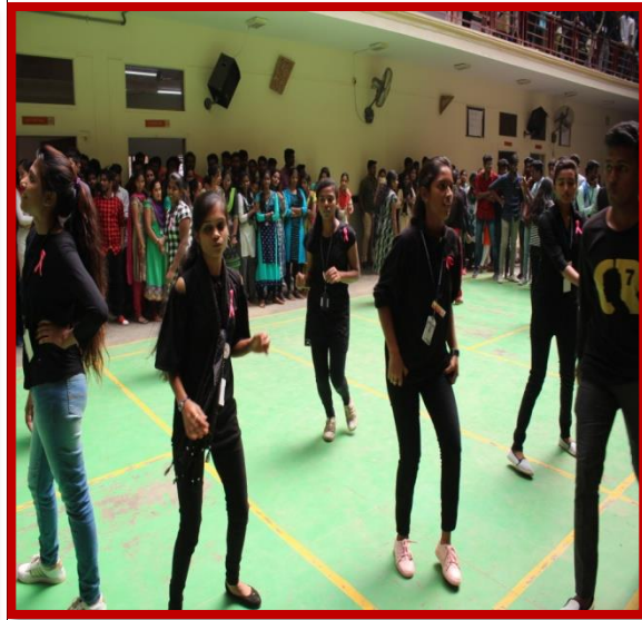
Cancer Awareness program on 27 th Feb, 2019