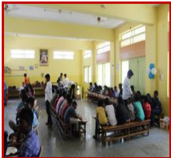
Joy of giving on 28 th Feb 2018