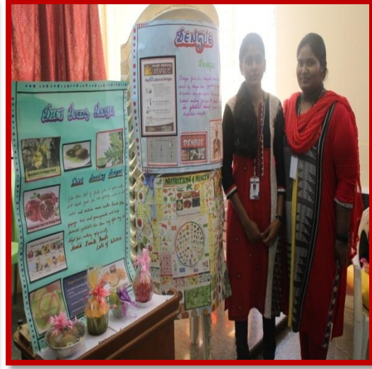
National nutrition week 2K18 from 1 st to 7 th September