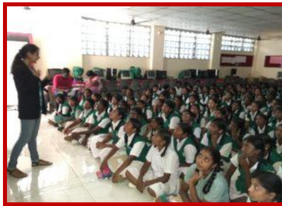
Time, Water and waste management awareness Program on 17 th August, 2017