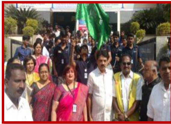
Polio Awareness Rally on 24 th October 2016