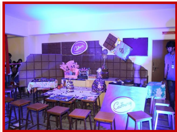
Marketing Expo on 7 th September 2017