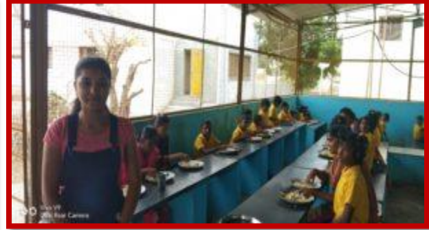
Food Drive On 24 th October 2018