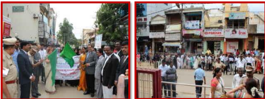
Human trafficking Rally on 7 th July, 2018