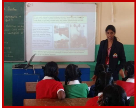
Awareness program on stress management from 9 th Aug to 17 th Aug 2016.