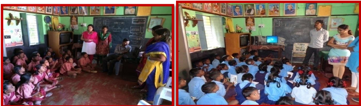
Computer Literary program from 1 st Feb to 12 th Feb 2016

Computer Literary program organized by the department of Computer Science This program is organized children and teachers to enrich Computer Knowledge from 1 st Feb to 12 th Feb 2016. The following topics were covered- Parts of Computer, PPT Presentation and its applications.85 students and 3 faculty members participated to inculcate the computer knowledge among the school children.