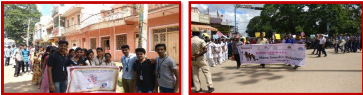
Swachh Bharath Rally on 11 th September 2017

Mera Swachh Vidyalaya, a program of Rotary India Literacy Mission and to support PM's Swachh Bharat Campaign in school and in college level. Rotary club of KGF in association with Rotaract club, NSS unit and all the Departments of SBMJC-K.G.F organized Swachh Bharath rally on 11 th September 2017 from King George Hall via Geetha road, Gandhi Circle and other popular streets in K.G.F. In this rally 1500 School students and 45 college students participated by holding creative pluck cards and singing slogans. It was an excellent opportunity to create awareness about being clean and keeping our city clean. The rally marched through the popular streets of K.G.F creating awareness for the public and the students actively participated and distributed sweets and chocolates for students and show cased their support to this cause.