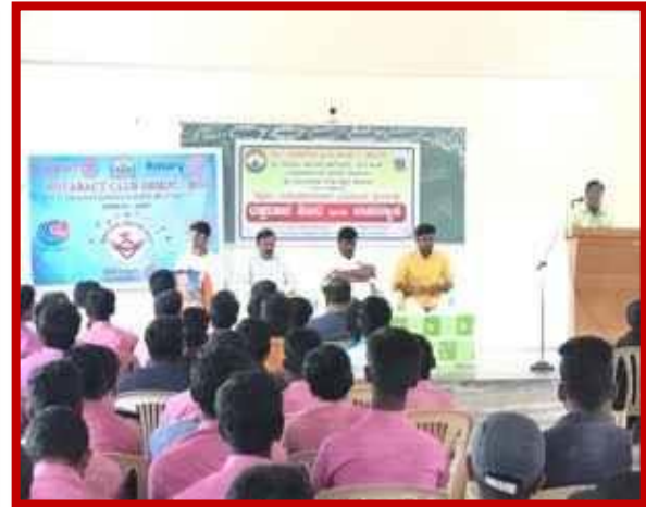
Swami Vivekananda Jayanthi celebration on 12 th January 2018