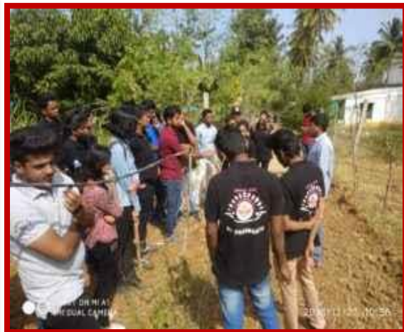
Kisan diwas celebrated on 23 rd December 2018