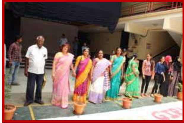
Big art on woman empowerment and End Polio on 5 th April 2018 (Deccan Herald and Praja vani News Paper)