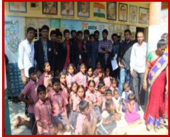
Computer Literacy Program on 15 th Feb 2018 to 26 th Feb 2018