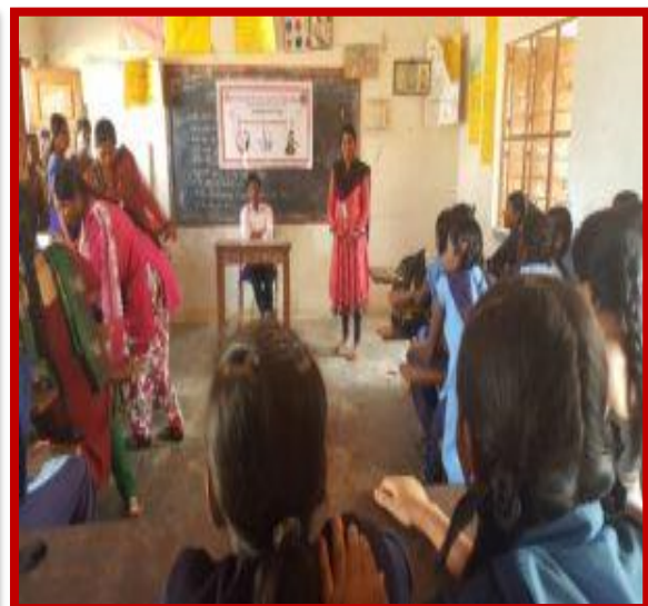
Awareness Program on Gender Issue on 11 th January 2017