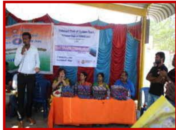
Joy of giving Distribution of blankets on 5 th January 2018