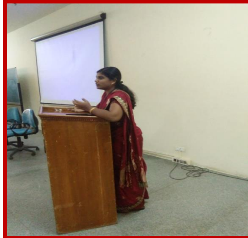
Gender issue and dressing sense awareness program on 2 nd August, 2017