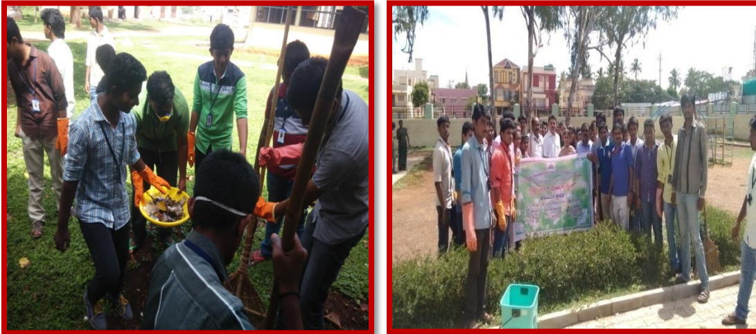
Swachh Bharath program on 25 th Aug 2015