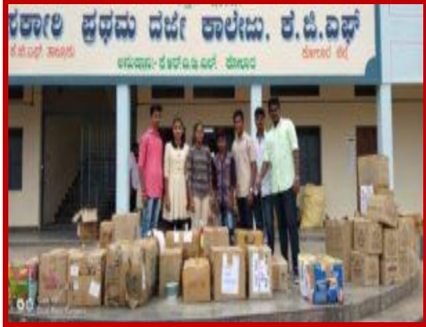
Kodagu Relief on 30 th August 2018