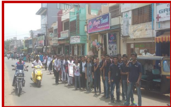
Animal Rescue Awareness Rally on 01 st July, 2017