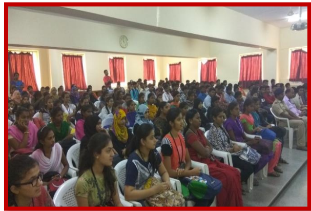
Legal and drug abuse awareness program by the Dept of Police on 27 th Feb 2017