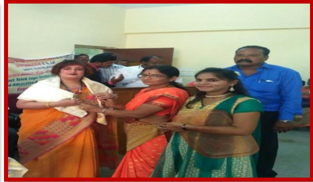
Program on Legal awareness, Human Trafficking and Drug Abuse on 4 th July, 2017