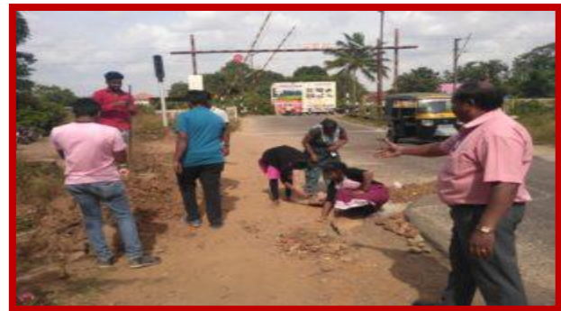
Shramdan at Oorguam railway Station Road on 26 th July, 2017