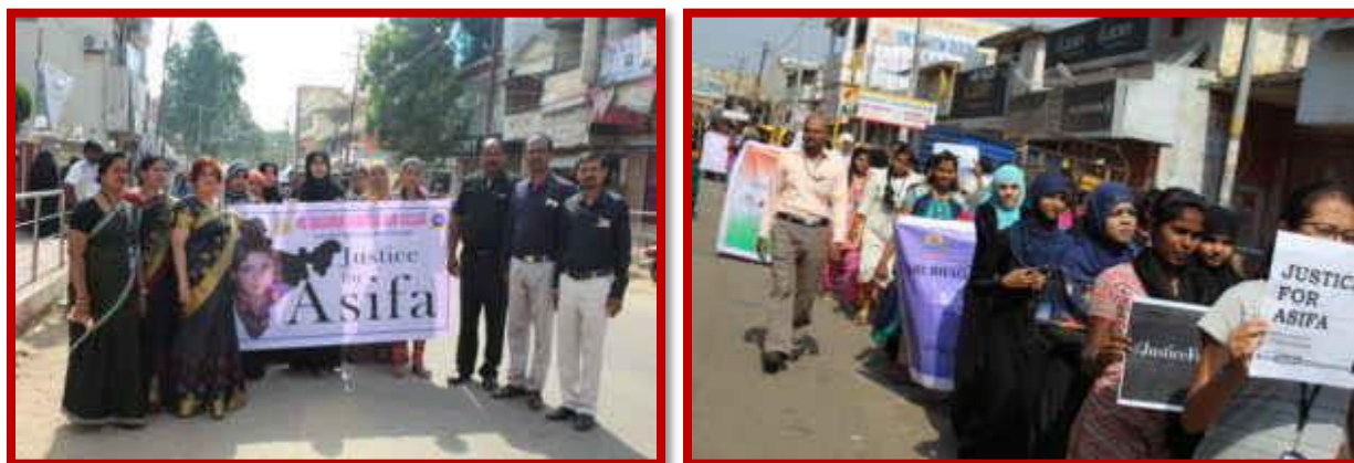
Rally on Justice for Asifa on 20 th April, 2018

An Awareness rally was organized for the public on justice for Asifa. 100 students participated and protested against human behavior and brutal murder of Asifa on 20 th April 2018.