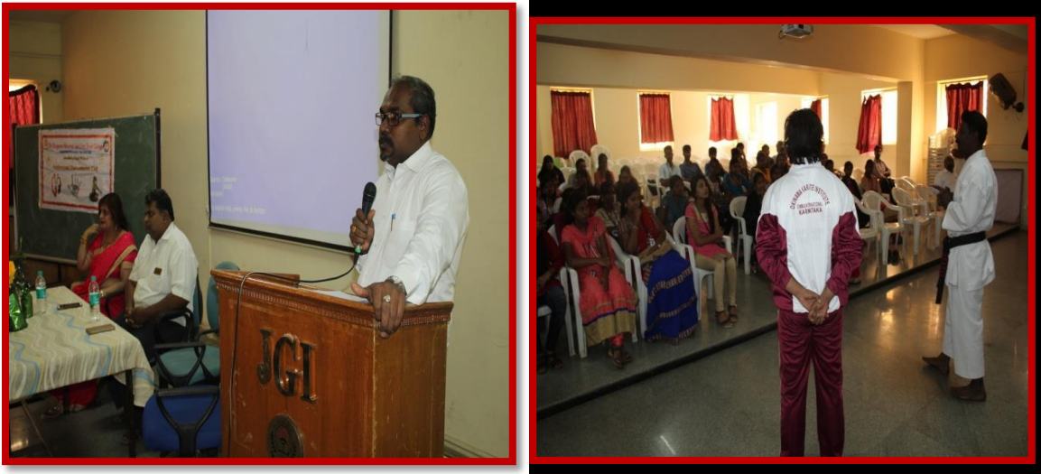
Voice out against sexual harassment guest lecture on 13 th August 2018